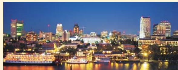
The view of the 'Old Sacramento' district and downtown skyline from West Sacramento's River Walk promenade.

We admit our civic pride may be influenced by a hometown bias but check out some of the national praise for Sacramento (at right) :